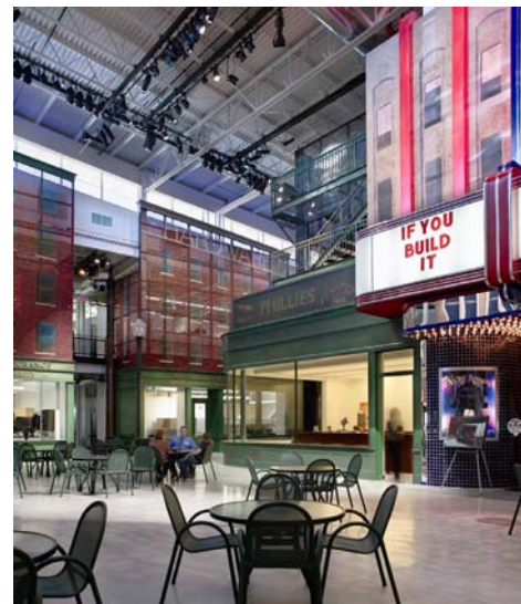
The atrium at ETC’s global headquarters in Middleton.